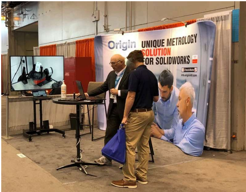
Origin booth at IMTS 2022

Origin's CheckMate add-ins provide unique metrology solutions for the SOLIDWORKS community. Visit Origin at IMTS to find out how CheckMate can transform your company into a model-based enterprise today.